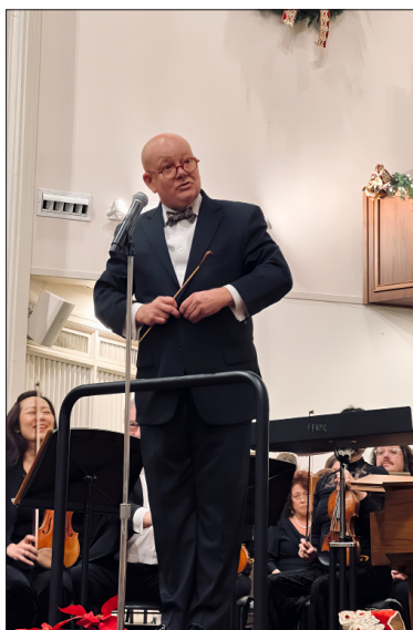
Lenten Concert April 13