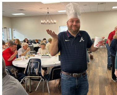
SOUPER BOWL Celebration Meal on March 19!

Visit, call, or email the church office to make reservations: 770-461-4313, admin@fayettevillefirst.com .