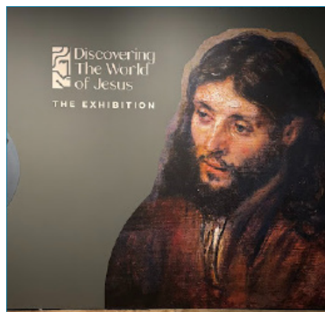
March 25 SAGE TRIP